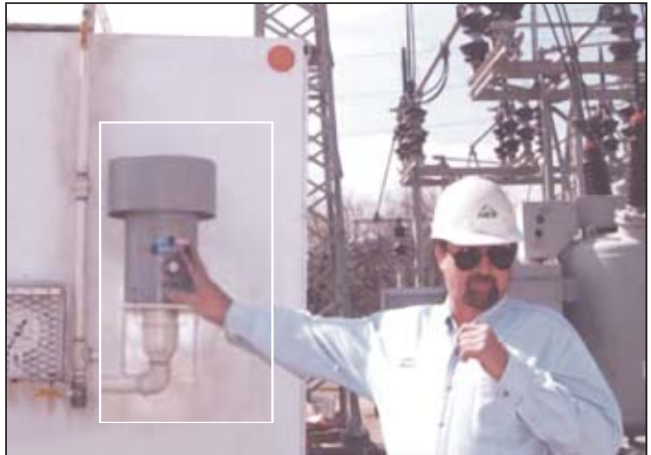
Figure 1 - Nashville Electric transformer with Des-Case Breather

For additional information visit our website- www.des-case.com